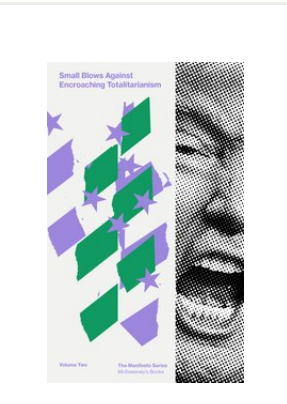
The second installment of our Manifesto Series is available for preorder. Orders will ship late January, 2019. Since the 2016 election, reading the news each day can send even the most placid...

Let us do away with the job market and mathjobs.com and reference letters. Let us stop pretending we understand each other's respective sub-fields. Let us abandon those fuck-ugly Brutalist travesties we call our department buildings and leave them to those shills in applied math. Let us seclude ourselves in mountain caves and daub mysterious equations in blood across rockfaces to ward off outsiders. Let us embrace our most impenetrable mathematical texts as sacred and requiring divinely distributed revelation.